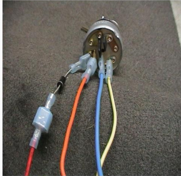
** IF ORANGE WIRE ON CURRENT KEY SWITCH **